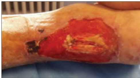
Figure 4. Day 14 of Natrox therapy commenced, increase in size of ulcer however healthier tissue now present.