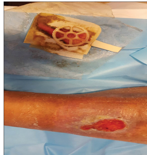
Figure 7 (right). Day 20 of Natrox therapy — ulcer larger but healthier appearance.

optimises cellular activity resulting in enhanced neutrophil and macrophage activity, which engulf the pathogens and debride the devitalised tissue.