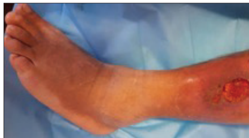
Figure 6 (above). Two-and-a-half-year-old venous leg ulcer, prior to Natrox therapy.