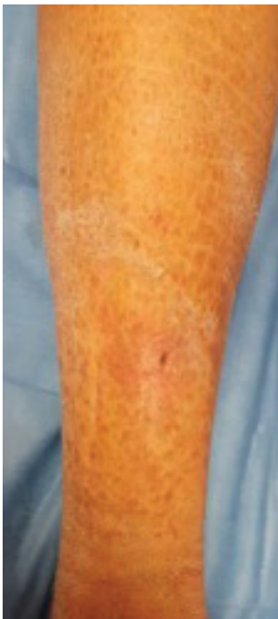
Figure 9. Day 65 almost healed – Natrox therapy discontinued.

owing to his involvement in the day-to-day management of the device. The ODS was applied directly on the wound bed, however, due to the high levels of exudate and the inability of the patient to tolerate compression bandaging, a non-adhesive polyurethane foam was used to cover the ODS, secured with a film dressing, and tubular bandage, the foam dressing helped to protect the periwound skin from maceration.