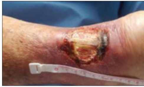
Figure 2. Two-year-old left achilles tendon ulcer.