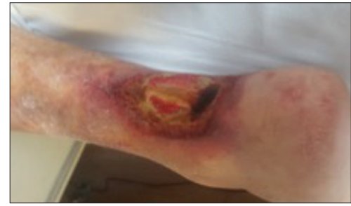
Figure 3. Ulcer following NPWT, some improvement noted, however, patient unable to tolerate due to pain.