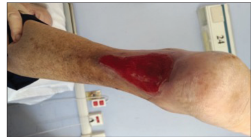
Figure 5. Day 35 of Natrox therapy, tendon now covered with granulation tissue.

13 ml of humidified oxygen per hour through a fine bore soft tube to a disposable Oxygen Delivery System (ODS). This is placed directly over the wound and held in place by a conventional dressing. The NATROX device is completely portable as it uses rechargeable and interchangeable batteries, which supply enough power to generate oxygen for a full 24 hours.