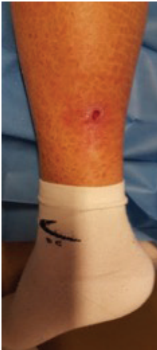
Figure 8. Significant reduction in size at day 47 of Natrox therapy.